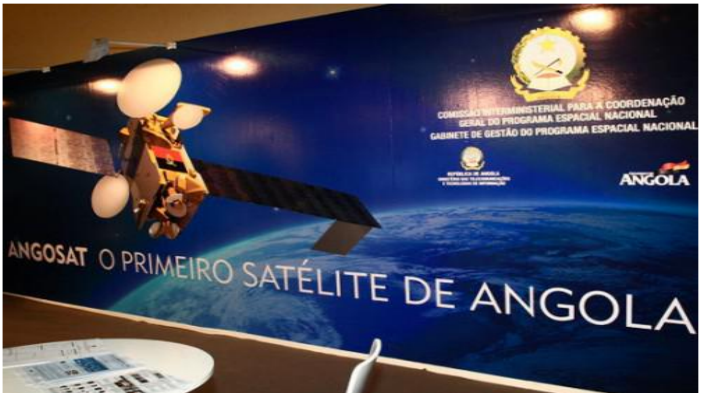
Angolan satellite, Angosat-1

The project to design and build the first Angolan satellite, Angosat-1, has an estimated cost of US$300 million, said Saturday in Luanda the minister of Telecommunications and Information Technology.