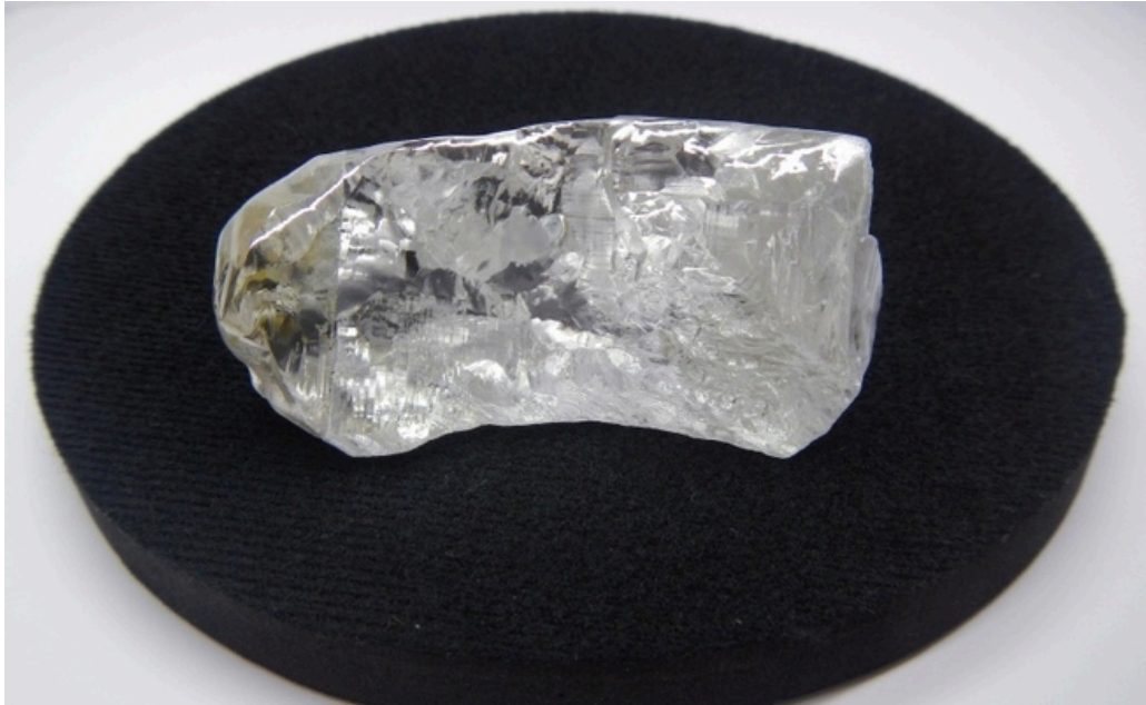
The largest diamond ever discovered in Angola

Australia's Lucapa Diamond Company has discovered a 404-carat diamond (80.8 grams) in Angola, the largest ever found in the country and the 27th globally, the company said in a statement released Monday.