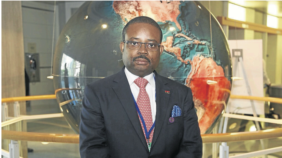
ARMANDO MANUEL - MINISTER OF FINANCE

The National Bank of Angola (BNA) is no subject to the inspection process for money laundering and financing of terrorism (AML/CFT), according to a recent report by the Financial Action Task Force (FATF), the bank said.