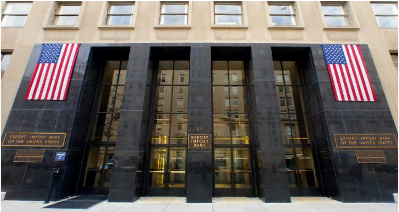
United States Export-Import Bank

A representative of the United States Export-Import Bank (ExIm) of the United States will meet with major banks operating in Angola and with government officials to provide information about its funding programs, the bank said in a statement.