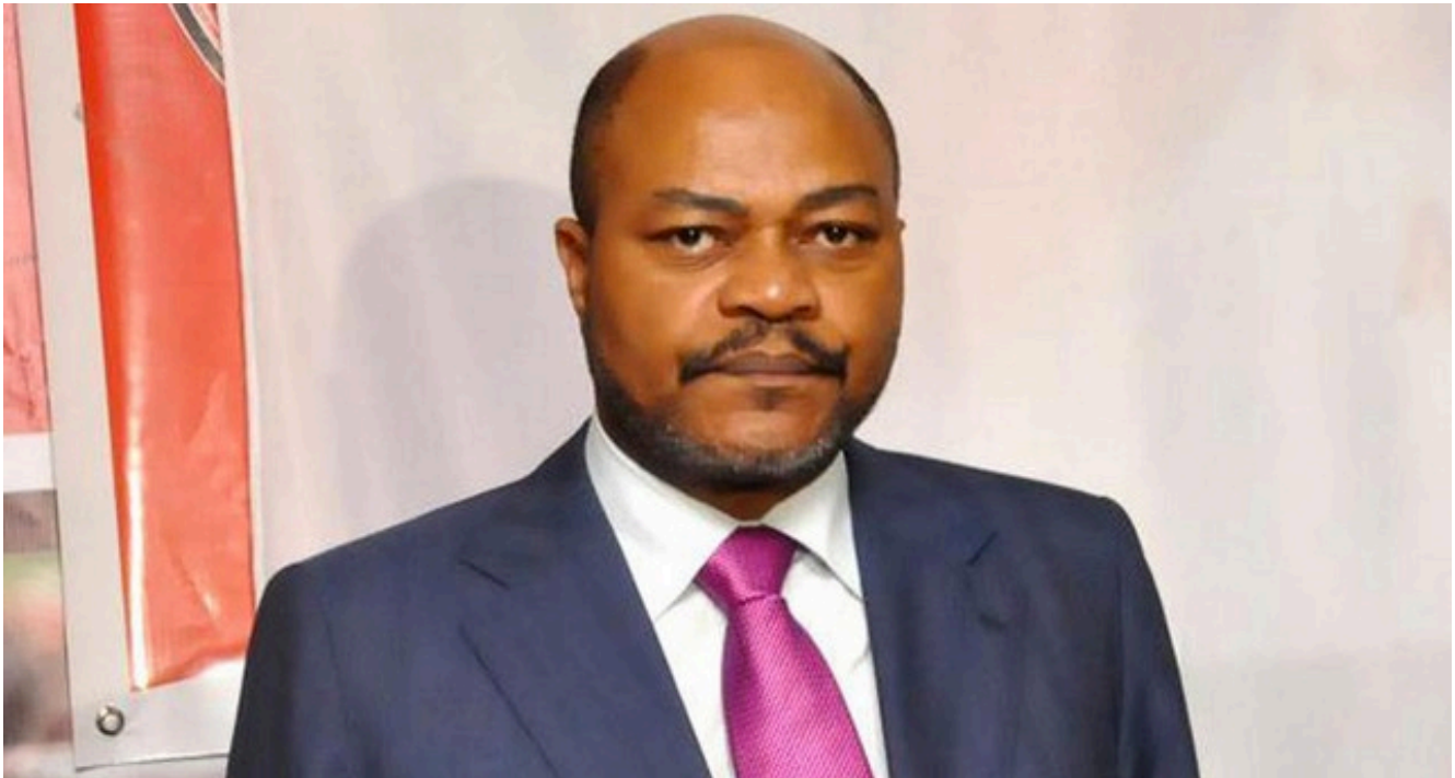
ABRÃO GOURGEL, MINISTER OF ECONOMY

The government of Angola will adopt a set of measures on taxation, monetary policy, foreign trade and the productive sector of the economy to respond to the crisis resulting from the sharp drop in oil prices, state newspaper Jornal de Angola reported.