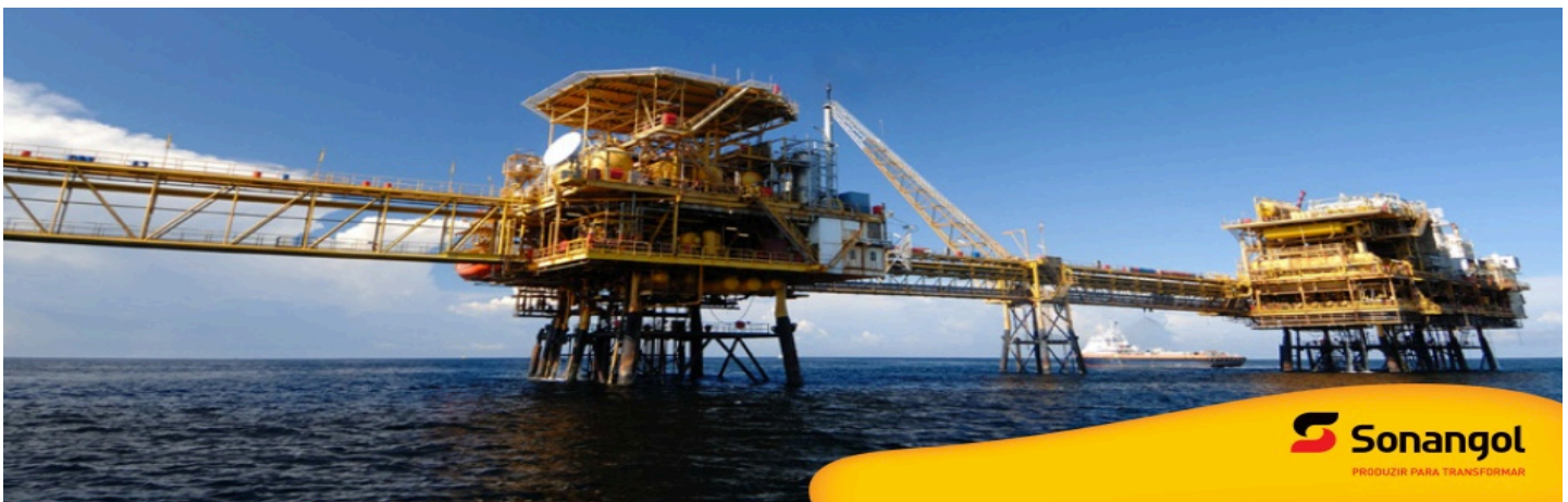
Sonangol's Oil Plattform