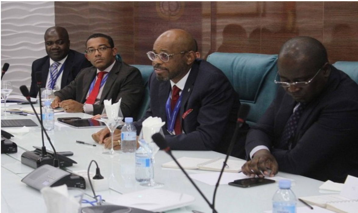
IMF MISSION GETS AQUAINTED WITH CMC PROGRESS

A delegation of the International Monetary Fund (IMF) is visiting Monday the headquarters of the Capitals Market Commission (CMC) to learn about its development.