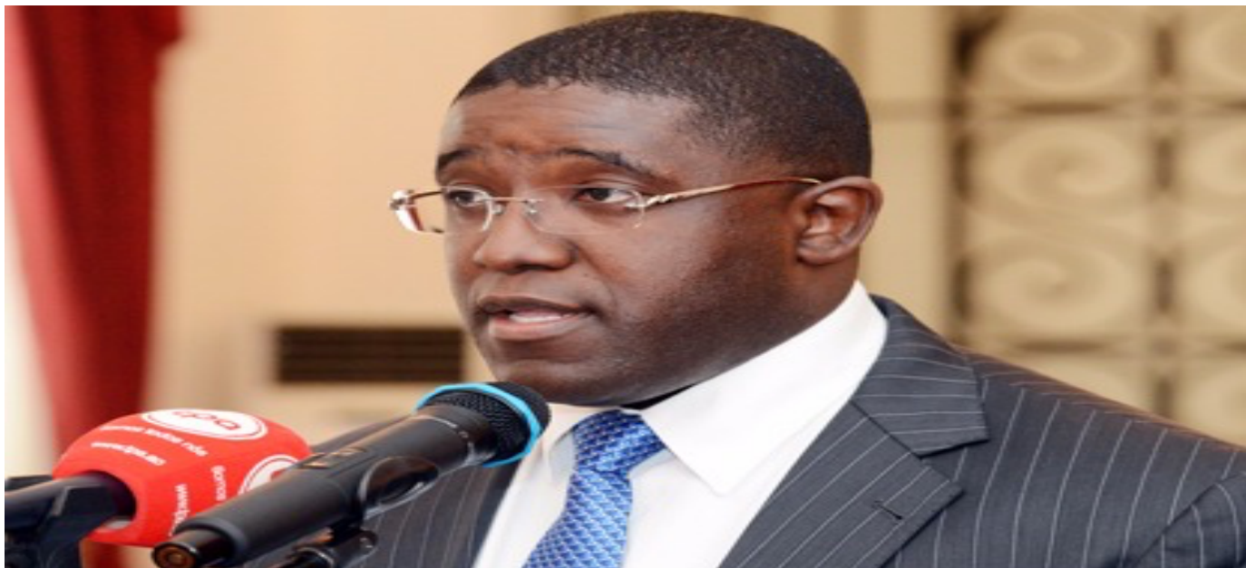
SERGIO DOS SANTOS - STATE SECRETARY OF ECONOMY

The Angolan government plans to create a new programme to finance the economy to replace Angola Investe, which last week was cancelled by the decision of the Economic Commission of the Council of Ministers, during a session that analysed documents from the National Bank of Angola and the Ministry of Economy and Planning.